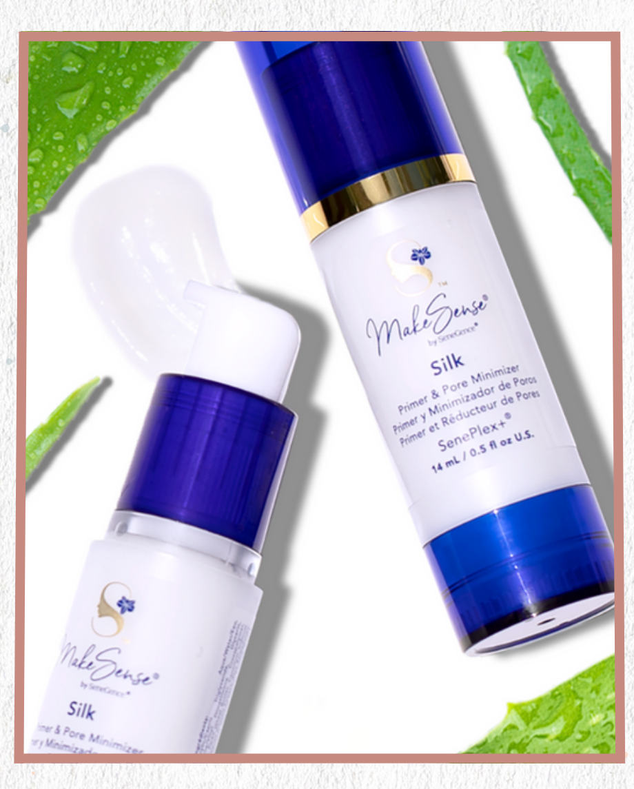
MakeSense Silk Primer & Pore Minimizer with SenePlex+

For a flawless, natural look, this formula works beautifully alone or under foundation. The instant filling and blurring effects reduce the appearance of fine lines, wrinkles, and pores, while its mattifying action absorbs excess oil and shine. Besides helping your makeup game, it helps your skin, too!