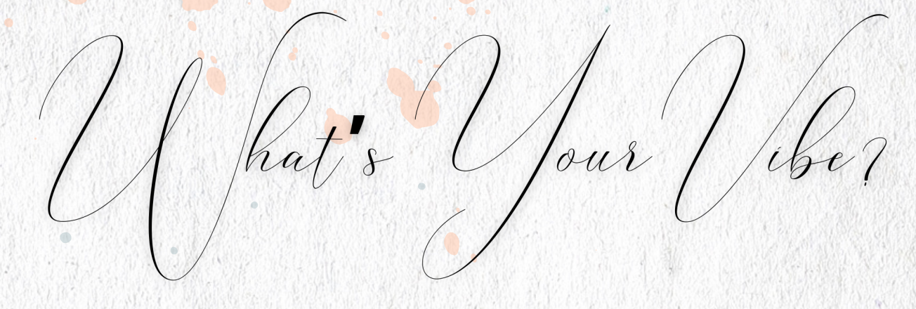
Relaxed & Connected:

From the coast to the city life! Whether you like relaxed, intimate settings or having fun outdoors, here are some ideas for the perfect night out!